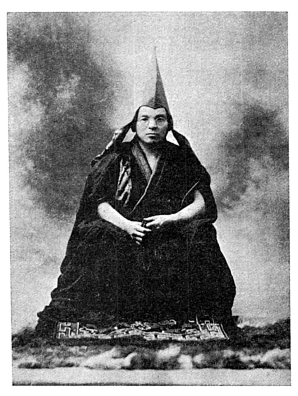
THE LAMA YONDGEN